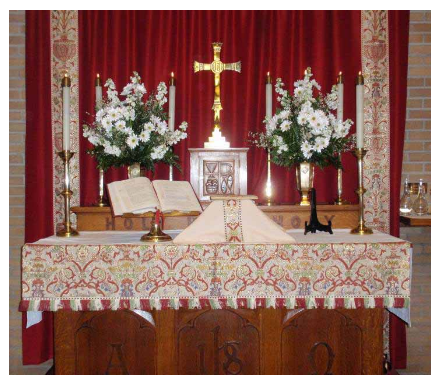
Alleluia! Christ is Risen. The Lord is Risen Indeed, Alleluia!